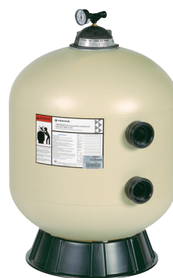
Triton II Side Mount Filter (Unions not included)

The original and still the industry standard. Our process creates a one-piece, fiberglass reinforced tank with UV resistant surface finish for years of unequaled strength and durability. This method locks in fiberglass, preventing fibers from “blooming” under harsh conditions.